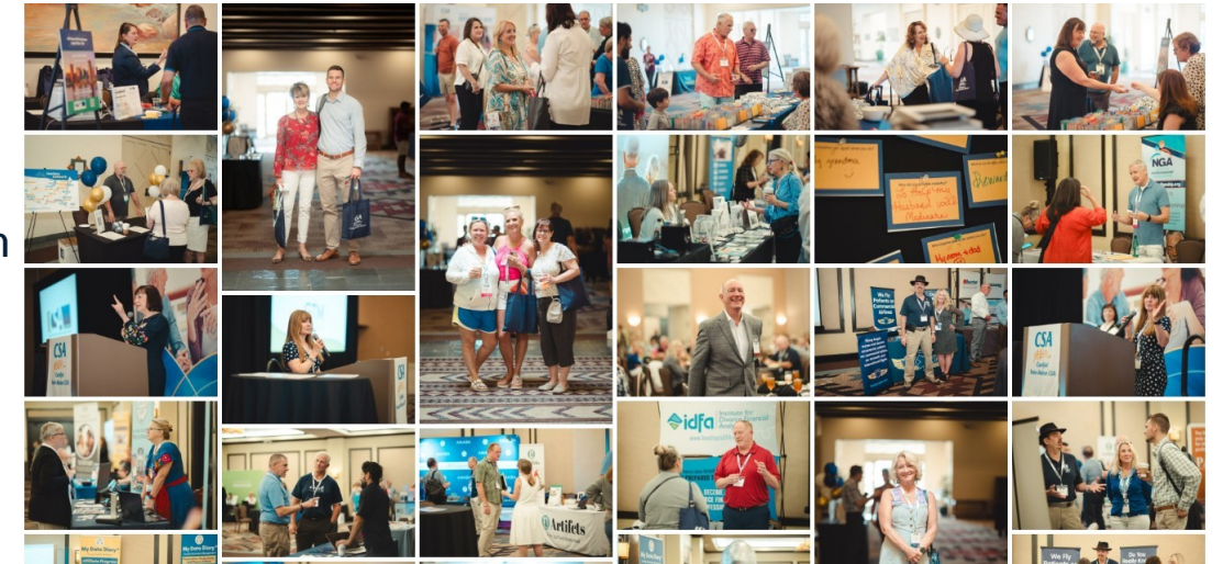
Conference Photo Gallery—2024 Conference

All packages are available on a first-come, first-served basis, and space is limited. Select item packages are exclusively available for only one sponsor per item! For additional questions email us at conference@csa.us or call 303-951-6571 .